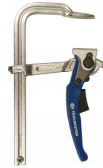
C0010 Ratchet F Clamp