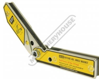
Open at Any Angle