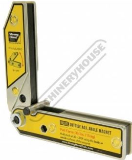
Set at 90 Degrees