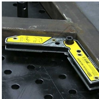
Shown in Use 2