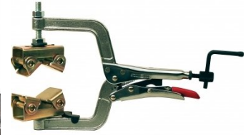
W1014 Pipe Plier - Large