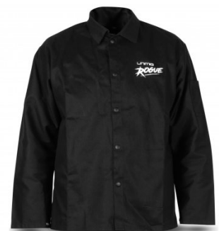
W1003 ROGUE™ PROBAN® Welding Jacket