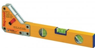
W1020 Magnetic Level