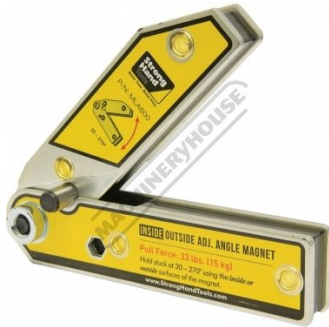
Set at 45 Degrees