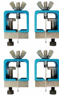
W113 Butt Welding Aluminium & Steel Clamp Set