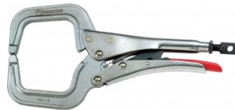
W1016 Locking C-Clamp - Round Tip