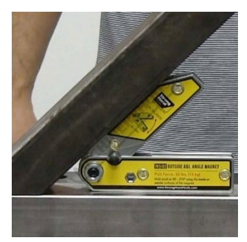
Shown in Use