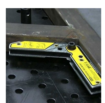
Shown in Use 2