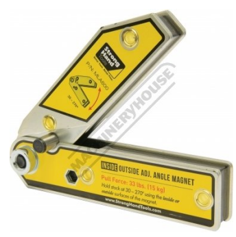
Set at 45 Degrees