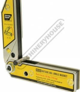
Set at 90 Degrees