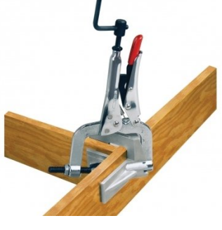
W1015 Pipe Plier