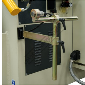
Material Length Reference Proximity Switch