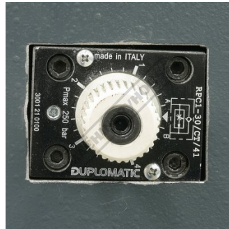
Hydraulic Pressure Adjustment Dial