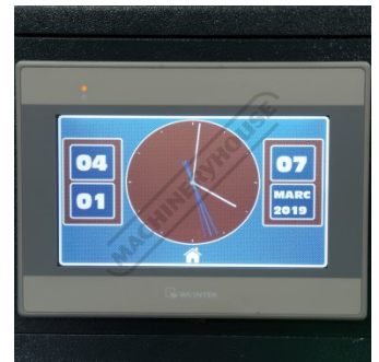
NC Control Time & Date Screen