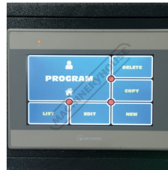
NC Control Program Screen