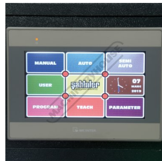
NC Control Main Screen