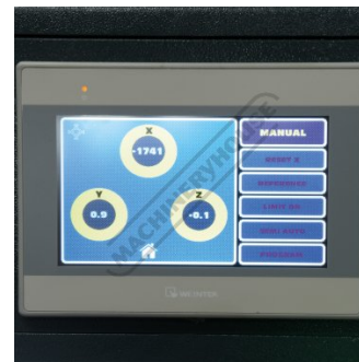
NC Control Manual Mode Screen