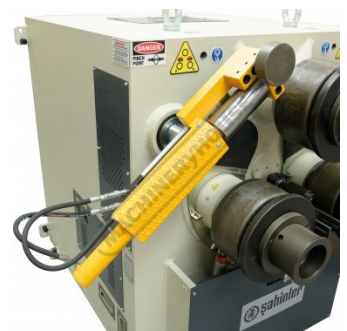
2-Axis Hydraulic Left Lateral Angle Guide Rollers