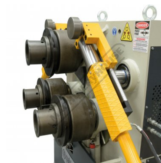
2-Axis Hydraulic Right Lateral Angle Guide Rollers