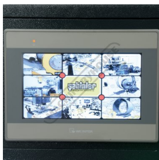
NC Control SAHINLER Screen