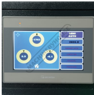
NC Control Semi Auto Screen