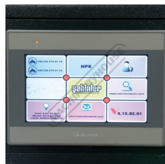
NC Control HPK Information Screen