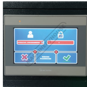
NC Control User Screen