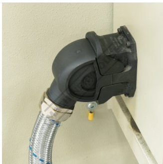
Control Panel Lead Connection