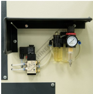
Air Pressure Regulator & Oil Lubricator