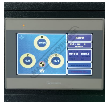
NC Control Auto Screen