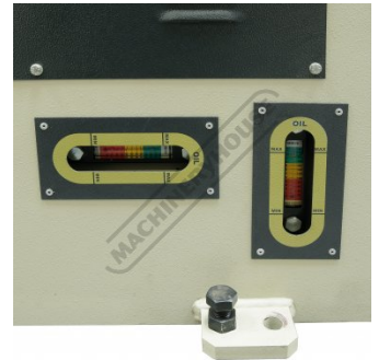
Oil Sight Glass