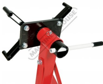
Handle and Index Lock Pin