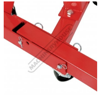
Leg Locking Pins