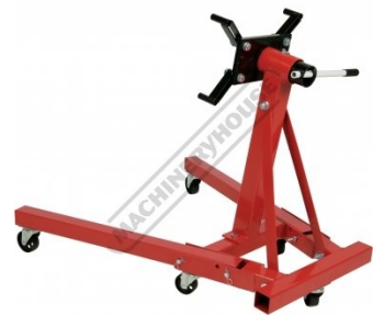
Rear Right View