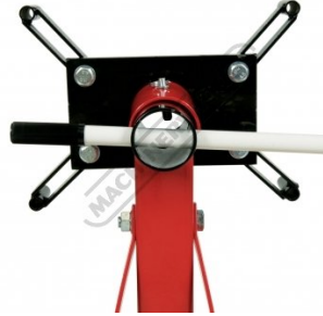
Index Lock Pin In Position 5