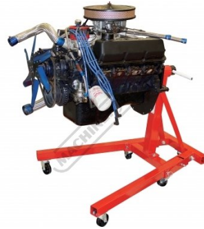
Shown with Ford 351 Engine - Front View