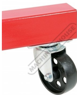
Five Swivel Castor Wheels