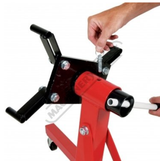
Index Lock Pin Released For Rotation