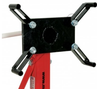
Four Adjustable Arms