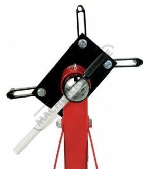
Index Lock Pin In Position 2