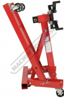
Fold Up Legs Side View