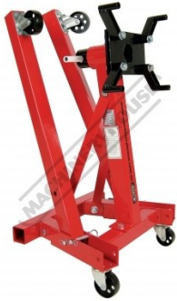
Fold Up Legs