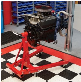
Shown with Ford 351 Engine - Rear View