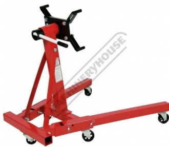
Rear Left View