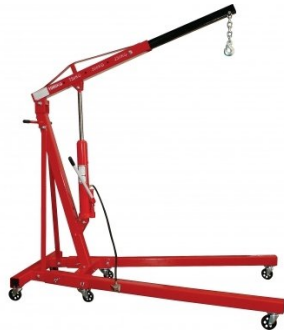
A351 Pneumatic & Hydraulic Engine Crane