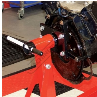
Mounting Position Shown with Ford 351 Engine