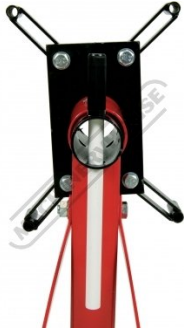
Index Lock Pin In Position 3