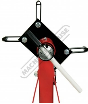
Index Lock Pin In Position 4