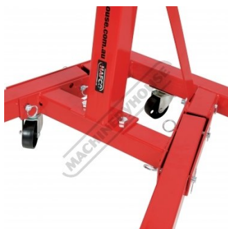
Leg Locking Pins Full View