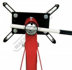
Index Lock Pin In Position 1