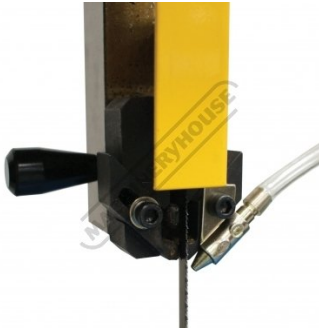
Adjustable Blade Guides and Air Pump