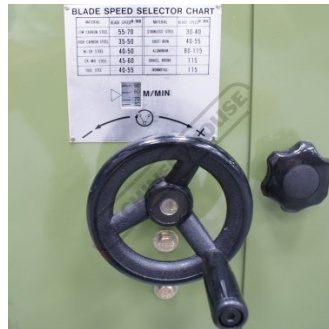
Variable Speed Handle