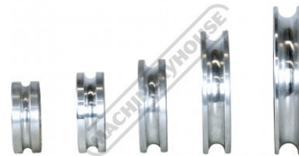
Round Formers Side View