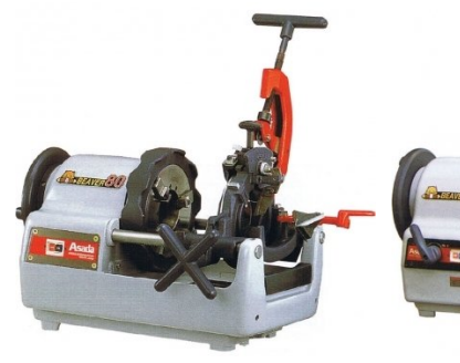
T024A Pipe Threading Machine Automatic Die Head