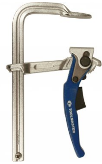
C0010 Ratchet F Clamp