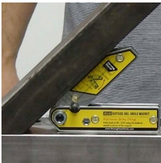
Shown in Use