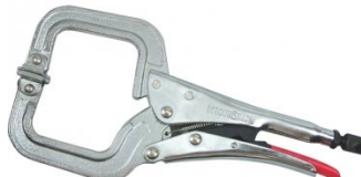
W1018 Locking C-Clamp - Swivel Tip