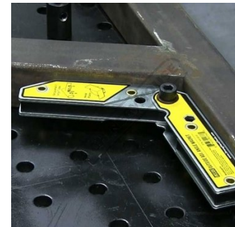
Shown in Use 2