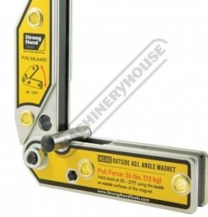
Set at 90 Degrees