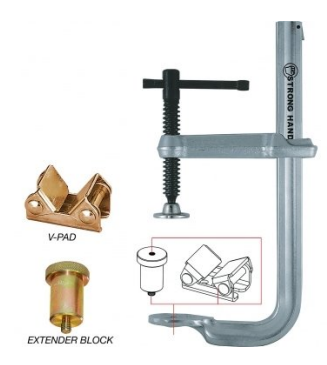
W1025 4 In One Utlilty Clamping System