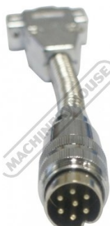
DIN7 Female Plug