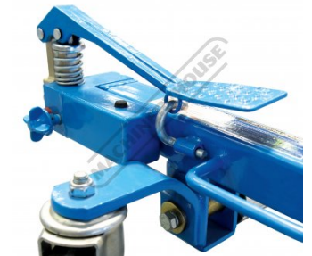
Foot Pedal Secured In Down Position