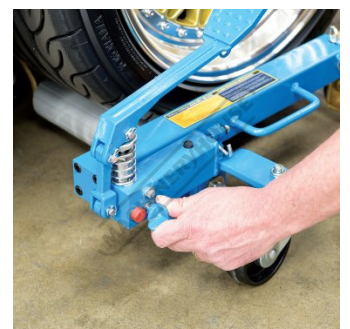
Closing Valve Ready To Lift Vehicle