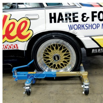
Jack in Place Ready To Lift Vehicle