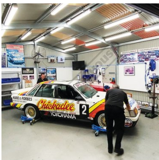
Moving Vehicle Into Position