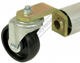
2 x Swivel Wheels