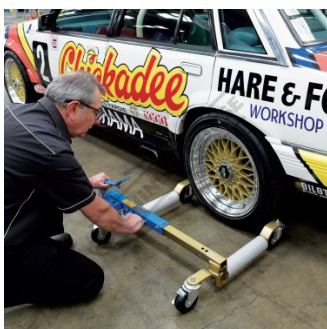
Sliding Jack in Positioning