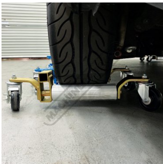
Vehicle Lifted Right Side View