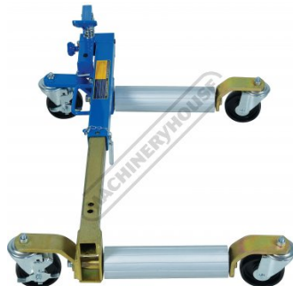
Side View Extended