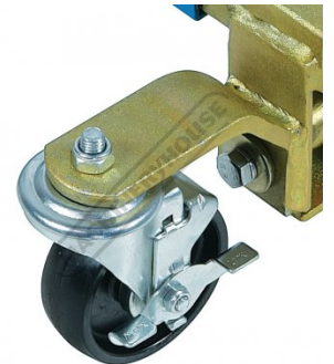
2 x Swivel Wheels with Brake