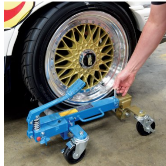
Inserting Safety Lock Pin