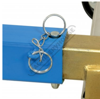
Safety Lock Pin For Ram