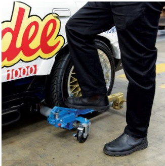
Hydraulic Foot Pump To Lift Vehicle