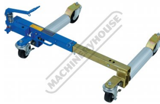
Right Side Extended