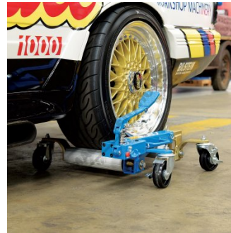
Wheels Jacked Ready to Move Vehicle