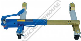
Front View Extended