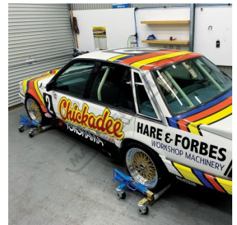
Vehicle on Jacks Ready to Move