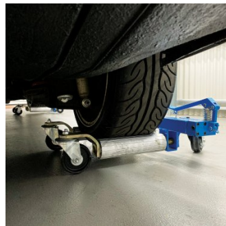
Vehicle Lifted Left Side View