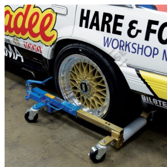
Jack in Place Ready To Lift Vehicle