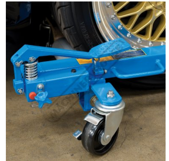
Foot Pedal Secured In Down Position