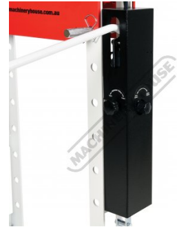
Enclosed Hydraulic Pump