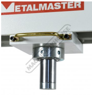
Sliding Ram With Handle