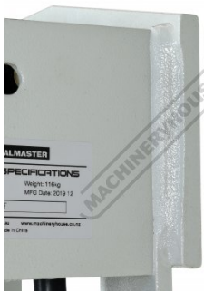
Robotic Welded Frame