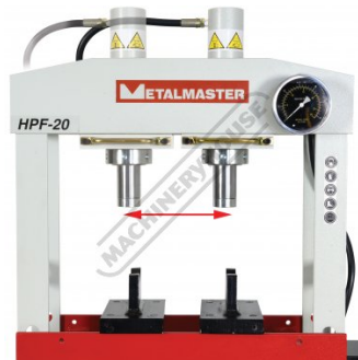
Horizontal Sliding Ram