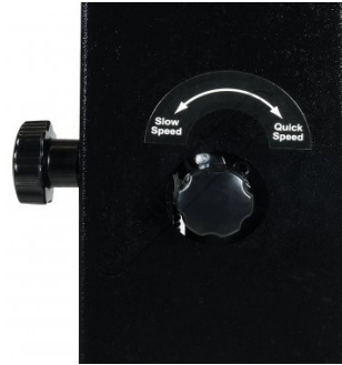
2 Speed Dial For Hydraulic Pump