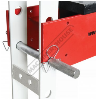
Table Pins With Safety Clips