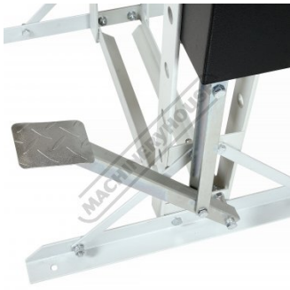
Foot Pedal For Hydraulic Pump