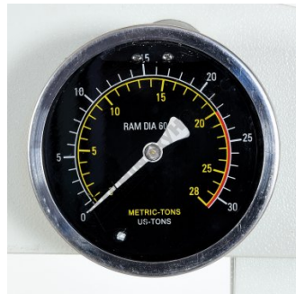
Metric / Imperial Pressure Gauge