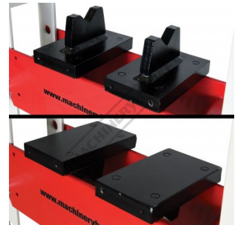
Dual Purpose Pressing Blocks