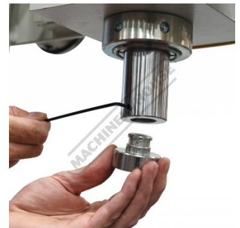
Includes Removable Ram Top Cap