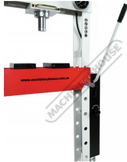
Hydraulic Hand Pump