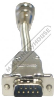
DSub9 Male Plug