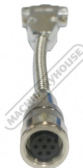
DIN7 Female Plug