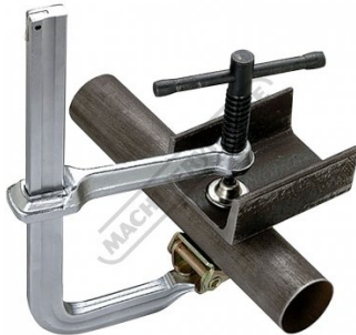
Clamping Steel Pipe