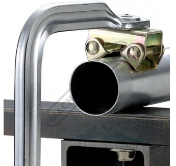
V Pad Jaw