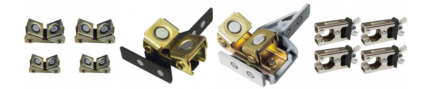
W112 Micro Welding Steel Clamp Set