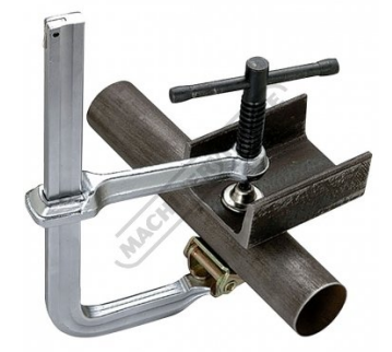
Clamping Steel Pipe