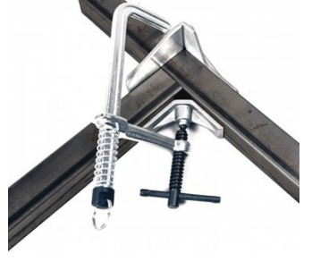
W1016 Locking C-Clamp - Round Tip