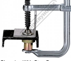
Clamping With Step Over