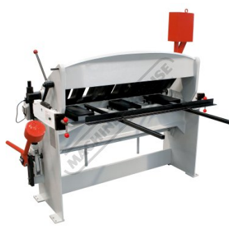
Rear Back Gauge