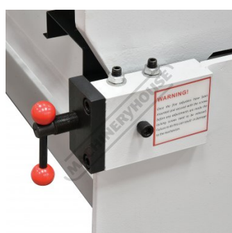
Quick Head Adjsutment Handle for Material Thickness