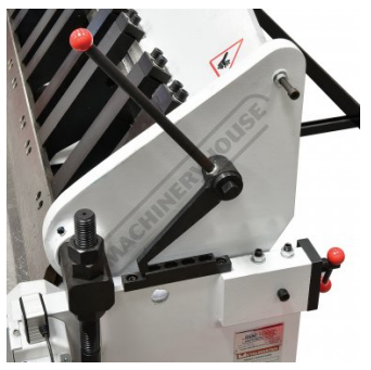
Top Beam Support Stop Lever and Thickness Adjustment Handle Removable Extra Long Fingers