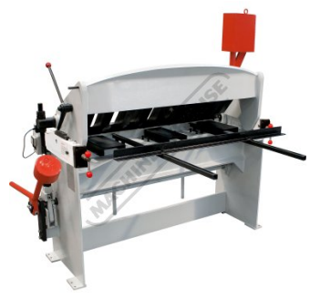
Rear Back Gauge