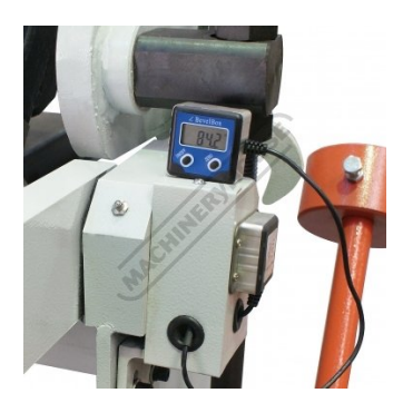
Digital Angle Readout