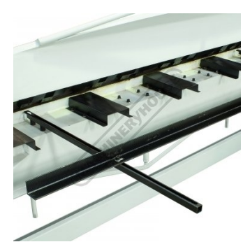
Rear Manual Backgauge