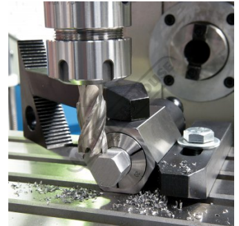
Shown Used with Hexagonal Holder