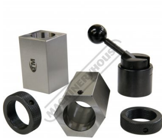
Square, Hexagonal Holders & Collet Clamp