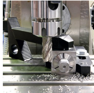
Shown Used with Square Holder