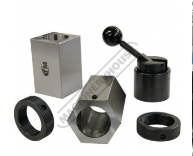
Square, Hexagonal Holders & Collet Clamp