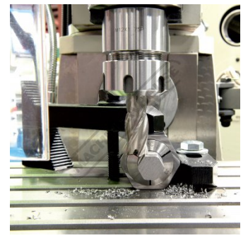
Shown Used with Hexagonal Holder Aluminium Storage Case