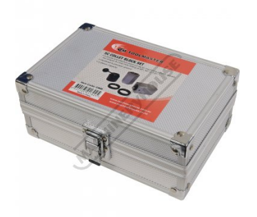
Aluminium Storage Case Closed