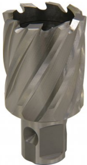
D9532 HSS Drill Broach Cutter