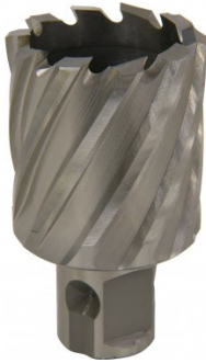
D9535 HSS Drill Broach Cutter