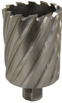
D9584 HSS Drill Broach Cutter