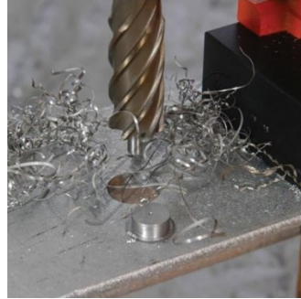
Shown in Action