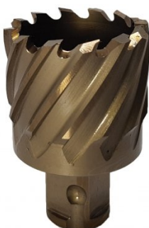
D939 HSS-Co (5% Cobalt) Drill Broach Cutter