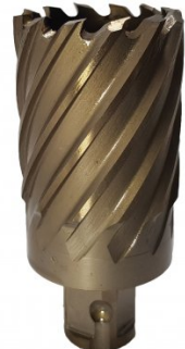
D938A HSS-Co (5% Cobalt) Drill Broach Cutter