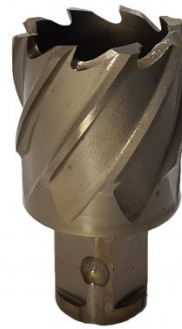
D932 HSS-Co (5% Cobalt) Drill Broach Cutter