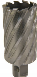
D9576 HSS Drill Broach Cutter