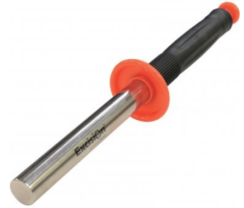
L300 Magnetic Swarf Remover