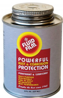
O043 Rust & Corrosion Preventive - Penetrant & Lubricant