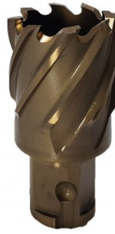
D930 HSS-Co (5% Cobalt) Drill Broach Cutter