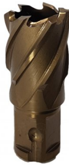
D925 HSS-Co (5% Cobalt) Drill Broach Cutter