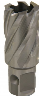
D9524 HSS Drill Broach Cutter