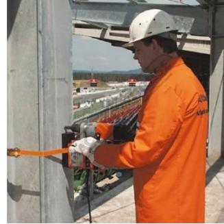
Shown in Action on Job Site