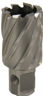
D9528 HSS Drill Broach Cutter