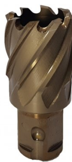
D928 HSS-Co (5% Cobalt) Drill Broach Cutter