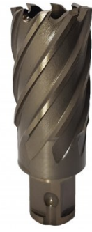
D930A HSS-Co (5% Cobalt) Drill Broach Cutter