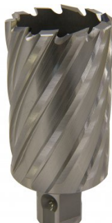
D9578 HSS Drill Broach Cutter