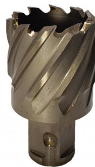
D934 HSS-Co (5% Cobalt) Drill Broach Cutter