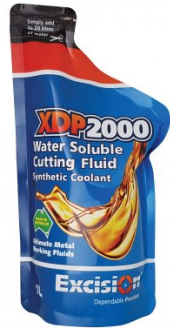
S090A Soluble Metal Cutting Fluid - 1 Litre