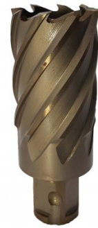
D932A HSS-Co (5% Cobalt) Drill Broach Cutter