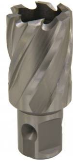
D9526 HSS Drill Broach Cutter