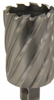
D9580 HSS Drill Broach Cutter