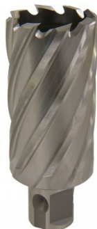
D9572 HSS Drill Broach Cutter