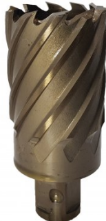
D936A HSS-Co (5% Cobalt) Drill Broach Cutter