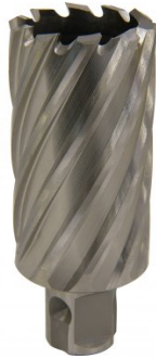
D9574 HSS Drill Broach Cutter