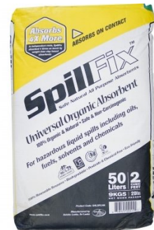
O000 SpillFix Universal Organic Absorbent