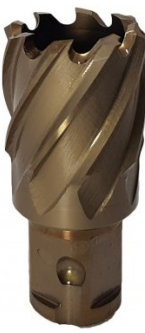
D926 HSS-Co (5% Cobalt) Drill Broach Cutter