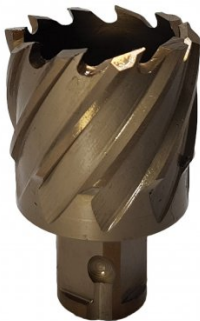
D936 HSS-Co (5% Cobalt) Drill Broach Cutter