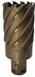
D935A HSS-Co (5% Cobalt) Drill Broach Cutter