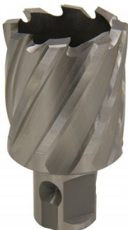
D9534 HSS Drill Broach Cutter