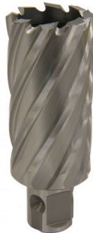
D9570 HSS Drill Broach Cutter