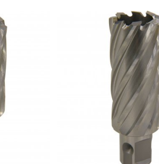
D9566 HSS Drill Broach Cutter