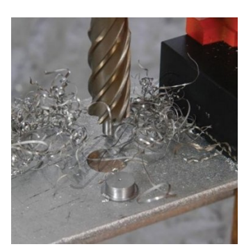
Shown in Action