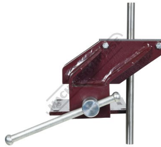
Vertical Work Without Obstruction