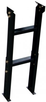
W343A Roller Stand