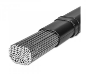
W128 Ø2.4mm TIG Filler Rod -Stainless Steel

W127 Ø1.6mm TIG Filler Rod -Stainless Steel