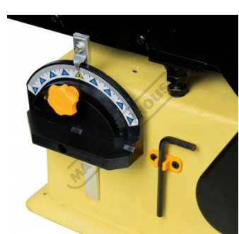
Tool Storage Holders