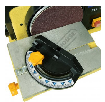
Adjustable Mitre Guide