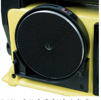
Hook & Loop Backing Pad For Quick Sanding Disc Change 150mm Sanding Disc