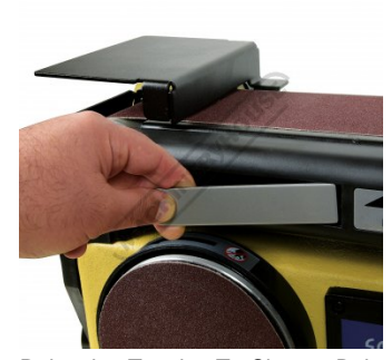
Releasing Tension To Change Belt