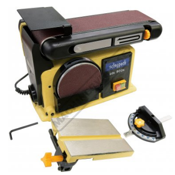
Shown with Table Removed