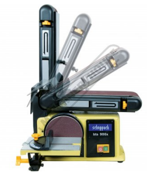
Horizontal to Vertical Linishing