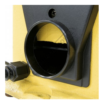
Dust Extraction Port

sales@machineryhouse.com.au www.machineryhouse.com.au