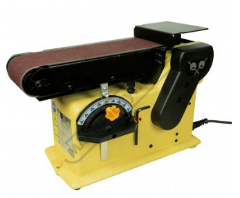
Side View Tool-Storage