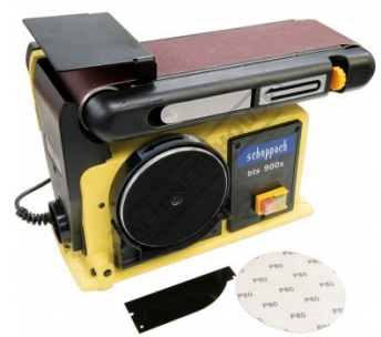
Removing Sanding Disc & Lower Guard Removed Sanding Disc & Lower Guard Motor Belt Tension Adjustment