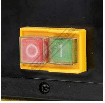
On Off Power Switch