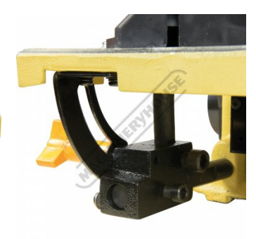
Tilting Table Adjustment Support