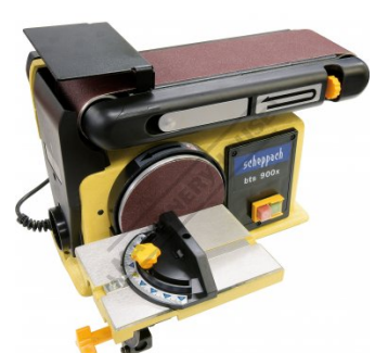
Table Set At 90° Degrees For Disc Sanding