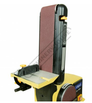
Vertical Belt Linishing with Table & Mitre Guide Vertical Belt Linishing with Table & Mitre Guide Full View Table Tilted 45° For Disc Sanding