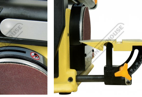
Tilt Table to 45 Degrees