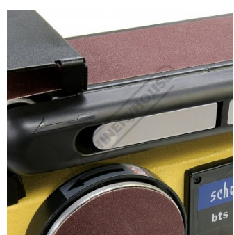
Belt Tension Release Lever