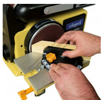
Shown Disc Sanding At 45° with Mitre Guide