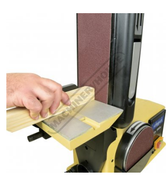
Lock & Unlocking Belt Linisher Head Step 1 - Remove Side Cover Lock / Unlocking Linishing Head Step 2 - Tighten Or Loosen 2 x Cap Screws Shown Sanding In Vertical Belt Positioning Shown Sanding In Vertical Belt Positioning 2