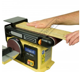
Shown Horizontal Flat Sanding