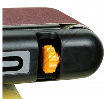
Belt Tracking Adjustment Dial