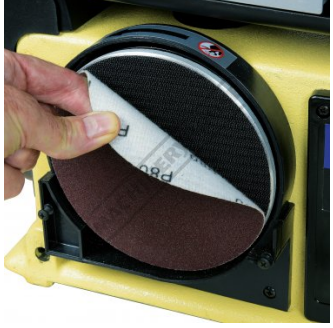
Hook & Loop Backing Pad