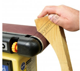
Shown Curved Sanding