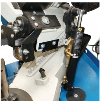
Hydraulic Ram Down Feed Control