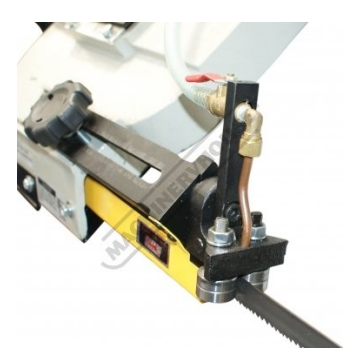
Coolant to Blades