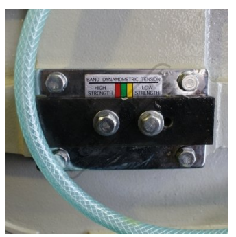
Band Dynamometric Tension Indicator