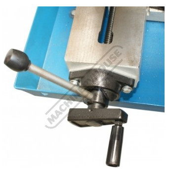
Quick Action Vice Handle Lever