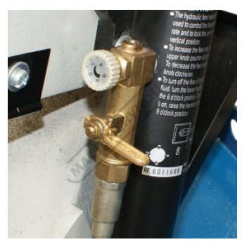
Down Feed Control