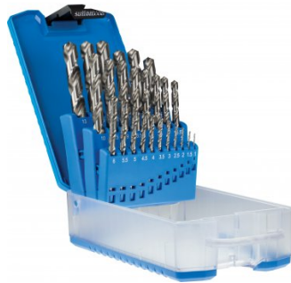
D123 Metric Precision HSS Drill Set - 25 Piece