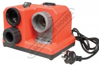
Shown with Lead