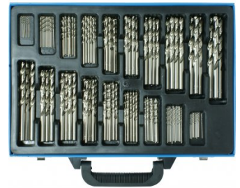
D126 Metric Precision HSS Drill Set - 170 Pieces