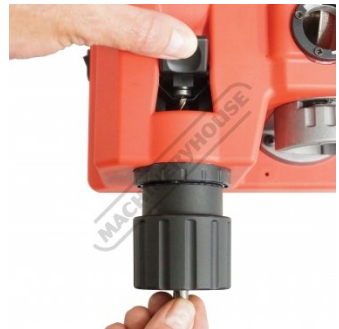
Setting Drill in the Chuck