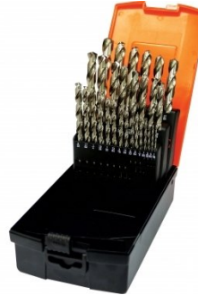
D1282 Imperial Precision HSS Drill Set - 29 Piece