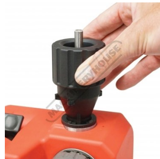
Facing the Back Angle Operation