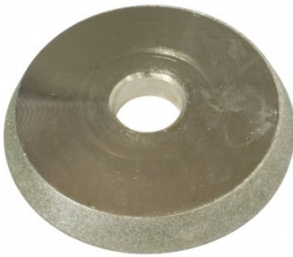
D0705 CBN Grinding Wheel