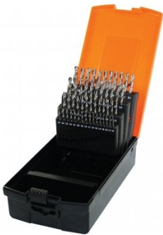
D1285 Metric Precision HSS Drill Set - 51 Piece