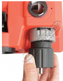
Grinding the Drill Operation