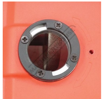
Back Angle Facing