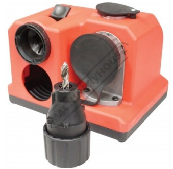
Shown with Covers On