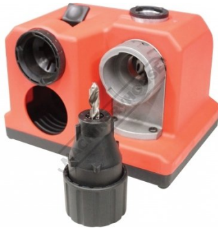
Shown with a Drill in the Chuck