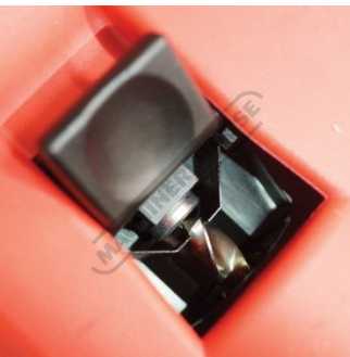
Setting the Drill