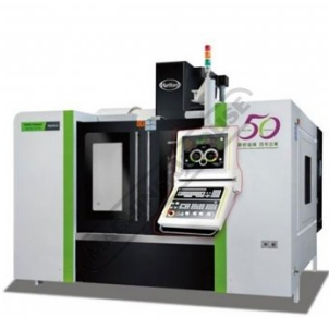
HCMC Hartrol Plus