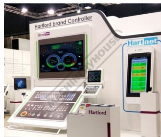
Hartrol Plus Large