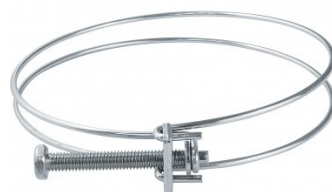
W340 Dust Hose Clamp