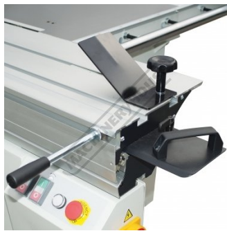
Table Handles and Table Lock