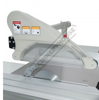
Blade Guard Raised Up