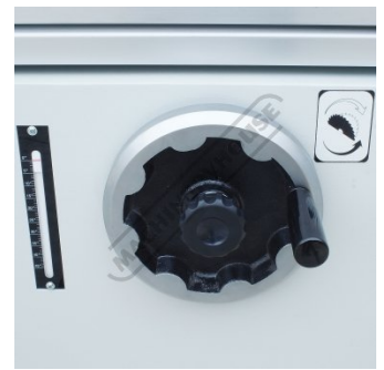
Blade Tilt Handle