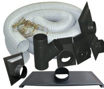
W344 Wood Dust Accessory Kit