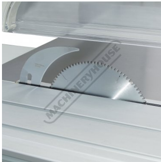
Main Blade Close Up