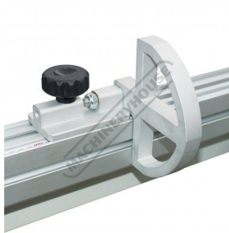
Flip Over Material Guide