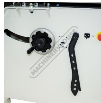
Blade Height Adjustment and Push Stick