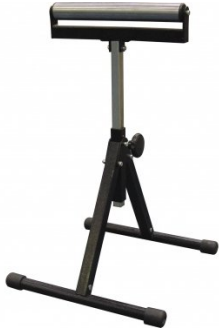
W343A Roller Stand