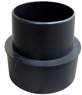
W333 Dust Hose Reducer