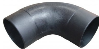
W336 Dust Hose Elbow