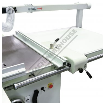
Fence Shown In Low Position For Thin Material