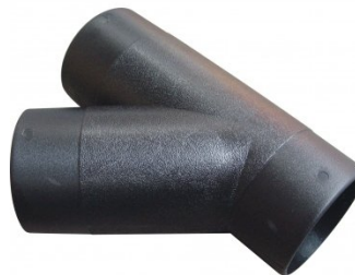
W337 Dust Hose Y Adaptor