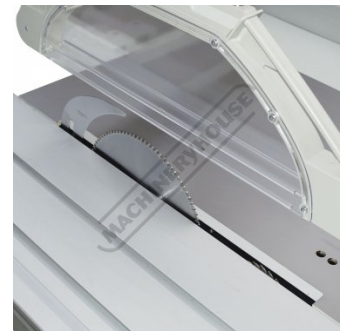
Main Blade with Scoring Blade