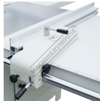
Heavy Duty Cast Fence Guide with Micro Adjustment