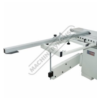
Solid Outrigger Table with Sliding Arm