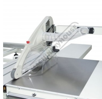
Tilting Blade Guard with Dust Extraction Hose