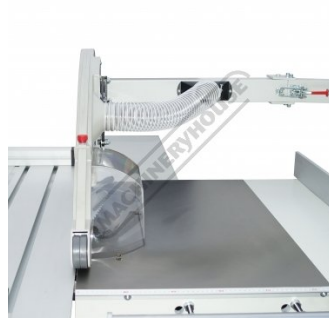
Tilting Blade Guard Front View