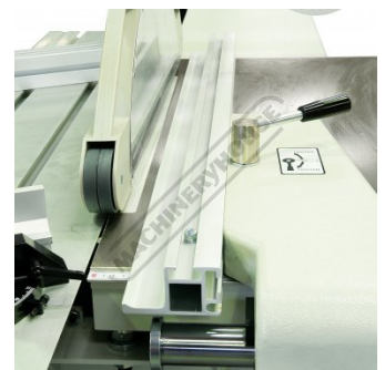
Heavy Duty Aluminium Extruded Fence with 2 Height Options