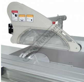
Tilting Blade Guard Raised