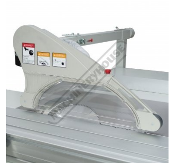
Tilting Blade Guard