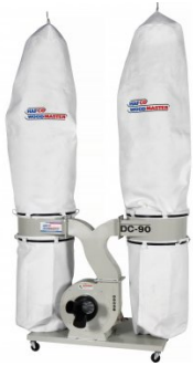
W331 Industrial Dust Collector