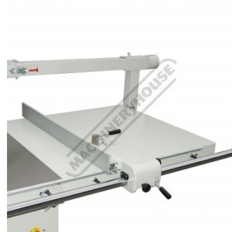
Fence Shown In High Position For Thicker Material