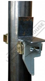
Angle Iron On Pipe