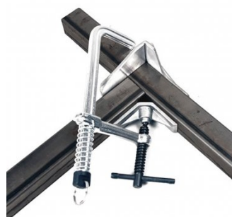
W1019 Corner Clamp