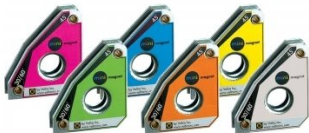
W1011 XYZ Magnet Squares - Multi-Angle - (2-Pack)