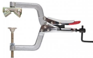
W1015 Pipe Plier