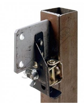
Tab On Square Tube