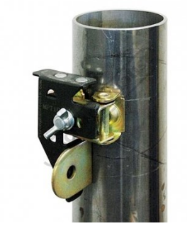
Parallel Tab On Square Tube