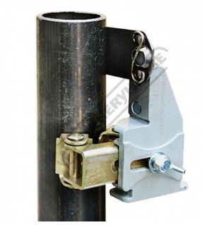
Offset Mounting On Pipe