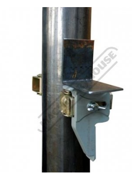
Angle Iron On Pipe