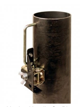
Positioning Handle On Pipe