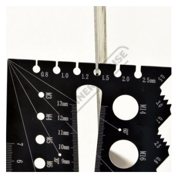
Material Thickness Check

sales@machineryhouse.com.au www.machineryhouse.com.au