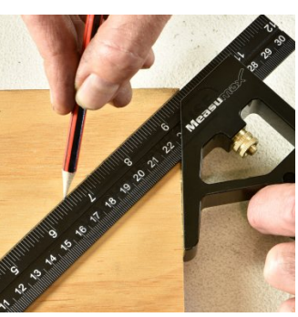
Marking 45 Degree