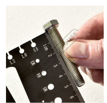
Checking Bolt Lenght