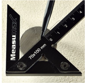
Finding Centre of Pipe