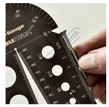
Checknig Screw Lenght