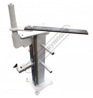
Shown On Optional Stand