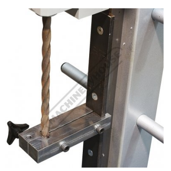
Shown Twisting Square Metal