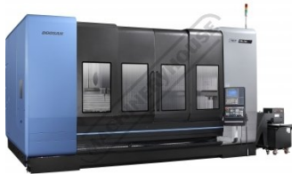
VCF 850L Closed