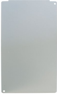
T789 Steel Divider