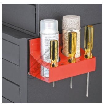
Shown on Side of Toolbox