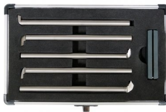
L006A Boring Bar Set - HSS