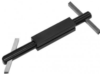
L100 Boring Bar with Holder