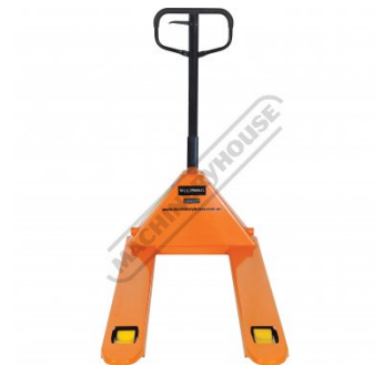
Front Entry View