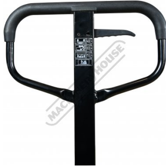
Handle In Neutral Position