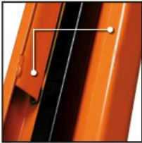
Welded Box Section