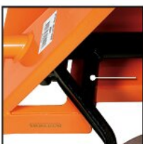
Extra Braced Frame