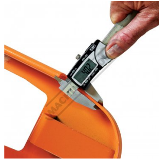
Channel Thickness 4mm