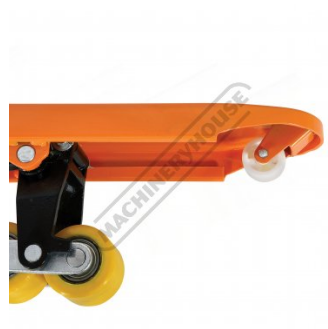
Front Wheel For Easy Pallet Entry