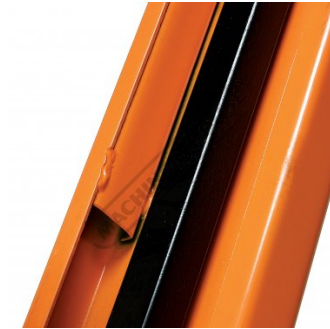
Frame with Rolled Edges and Welded In Box Section for Increased Strength