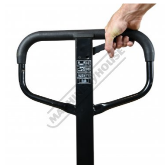
Handle In Release Position