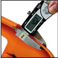
4mm Thick Steel Plate