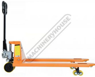
Side View Raised