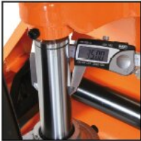
35mm Diameter Ram