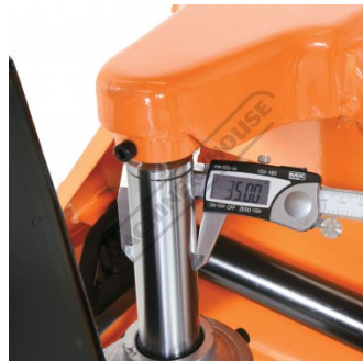
Large 35mm Diameter Piston Lifting Ram