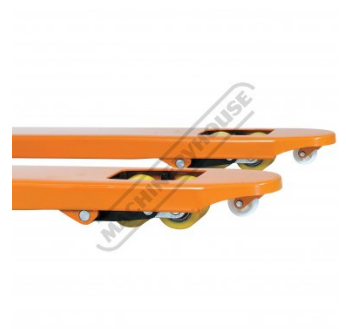
Dual Front Wheels Lowered