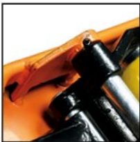
Heavy Duty Wheel Housing