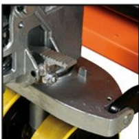
Foot Release & Heavy Base