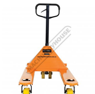
Front View Raised