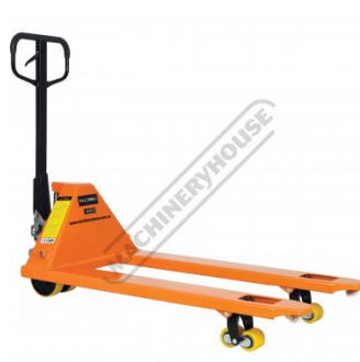
Side View Raised