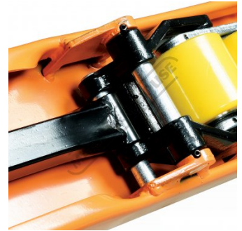
Front Wheel Hinge Reinforced Welded Bracket