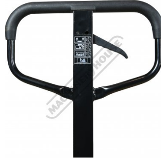
Handle In Engaged Ram Position