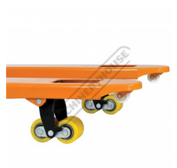
Front Entry Wheels Raised