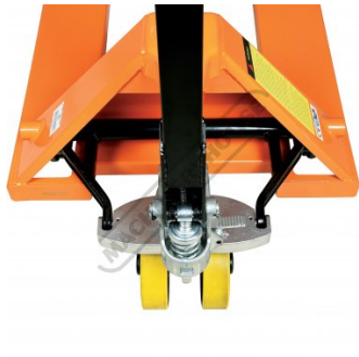
Rear Frame with Extra Cross Members for Additional Strength