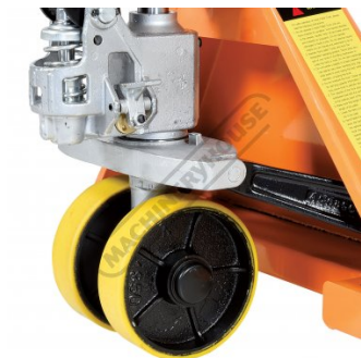
Large Double Rear Wheels