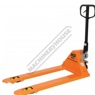
Side View Lowered