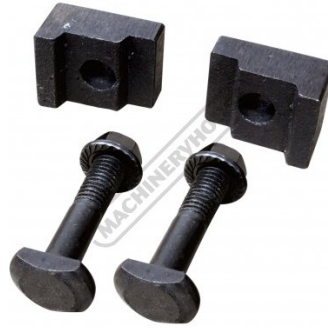
Nuts and Bolts