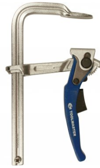
C0010 Ratchet F Clamp