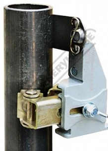
Offset Mounting On Pipe