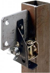
Tab On Square Tube