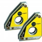
W1009 Mini Magnet Squares - (2-Pack)