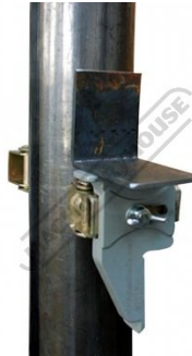
Angle Iron On Pipe