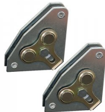
W1011 XYZ Magnet Squares - Multi-Angle - (2-Pack)