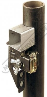
Square Tube Section On Pipe