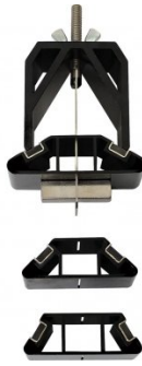
W114 3 Angles Welding Aluminium Clamp Set