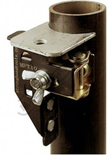
Perpendicular Tab On Pipe