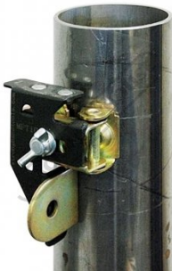
Parallel Tab On Square Tube