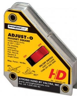
W1006 Adjust-O Magnet Square - Heavy Duty