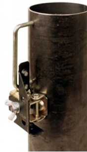
Positioning Handle On Pipe