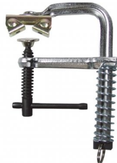
W07970 BuildPro Magspring Clamp