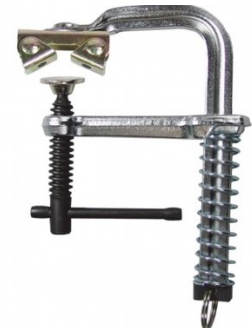
W07971 BuildPro Magspring Clamp