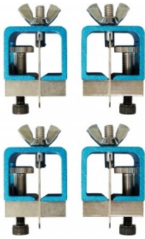
W113 Butt Welding Aluminium & Steel Clamp Set