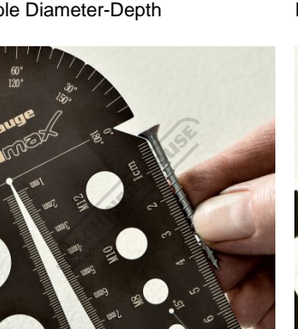
Checknig Screw Lenght