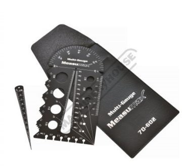
Includes Protective Pouch