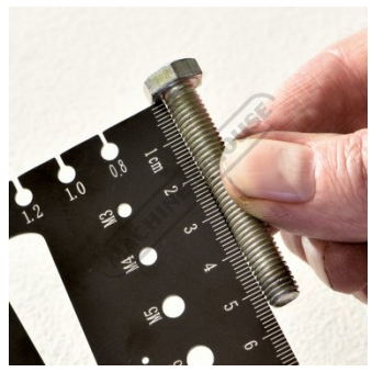
Checking Bolt Lenght