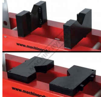
Dual Purpose Pressing Blocks