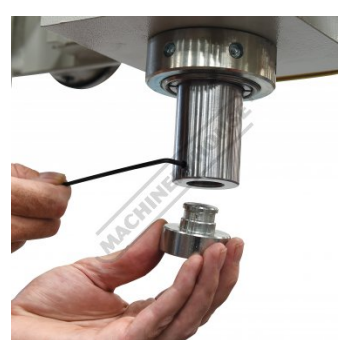
Includes Removable Ram Top Cap