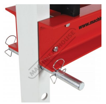
Table Pins With Safety Clips