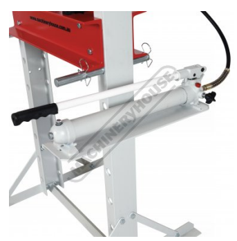
High Quality Hydraulics