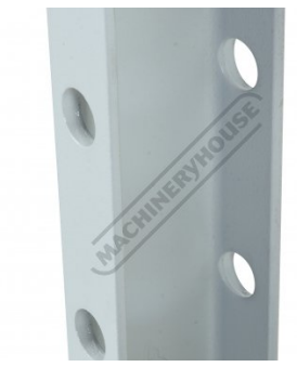
Solid Side Channel Frame