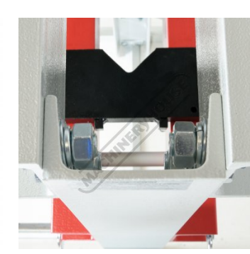
Solid Channel Frame