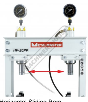
Horizontal Sliding Ram