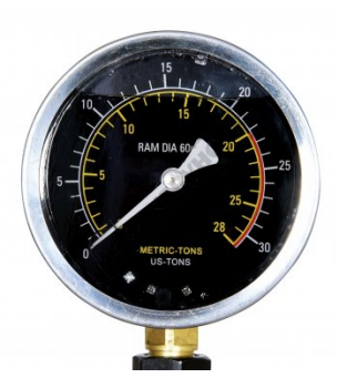
Metric / Imperial Pressure Gauge