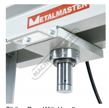
Sliding Ram With Handle