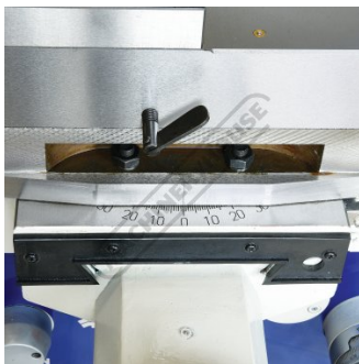
Compound Slide Angle Scale