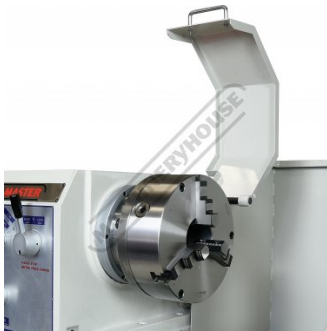
Safety Chuck Guard Open