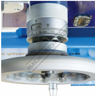
Saddle Hand Wheel