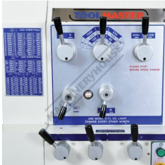
Spindle Speed Selectors