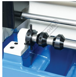
Adjustable 4 Position Length Stop