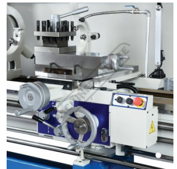
Saddle Right View