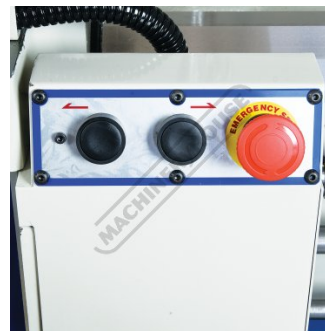
Rapid Longitudinal Buttons and Emergency Stop