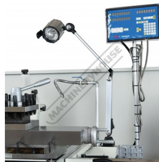
Coolant System and Work Light