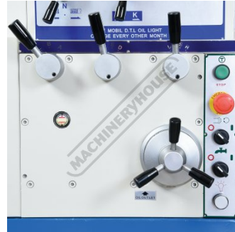
Universal Enclosed Gearbox