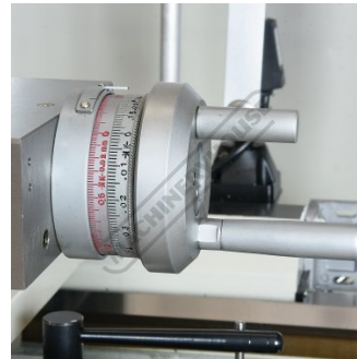
Compound Slide Hand Wheel