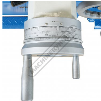
Cross Feed Hand Wheel