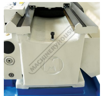
Meehanite Cast Base