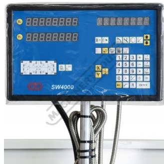
2 Axis Digital Readout System