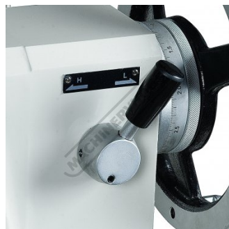
2 Speed Tailstock