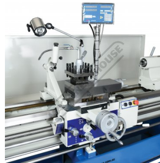
Saddle Left View