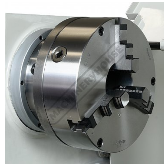
3 Jaw Chuck