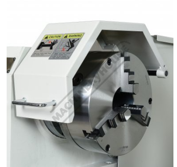
Safety Chuck Guard