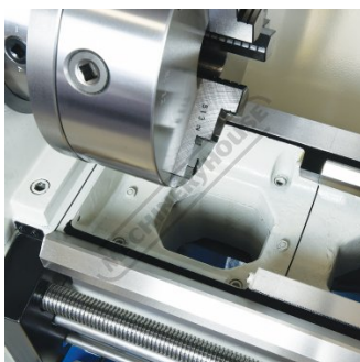
Removable Gap Bed