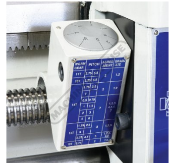
Thread Chasing Dial