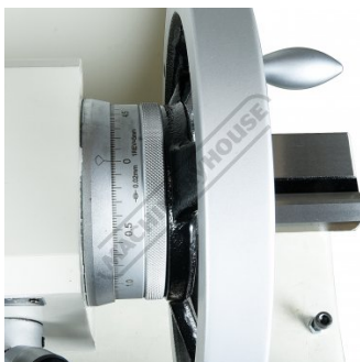
Tailstock Hand Wheel