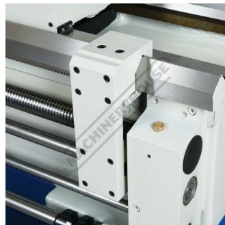
Moveable Leadscrew and Feed Shaft Support