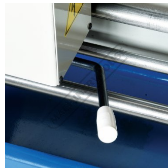
Spindle Engagement Lever