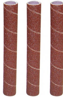
A8112 Bobbin Sanding Sleeves - Pack of 3