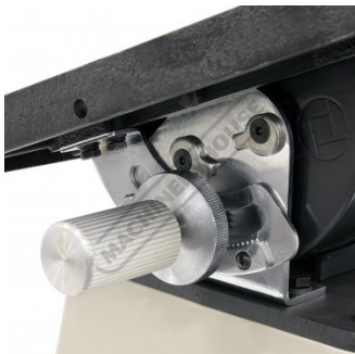
Table Tilt Geared Adjusting Dial & Lock - Right View