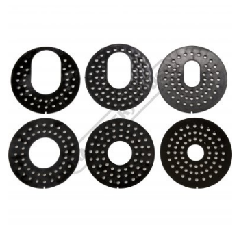
Table Inserts for 90 & 45 Degrees Sanding