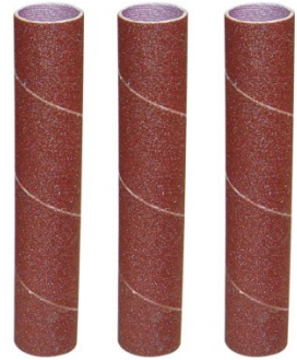
A8114 Bobbin Sanding Sleeves - Pack of 3