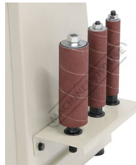
Storage Trays for Sanding Spindles