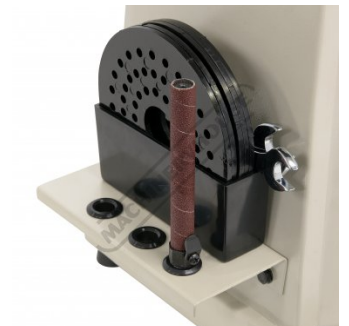
Storage Trays for Table Inserts & Spindles