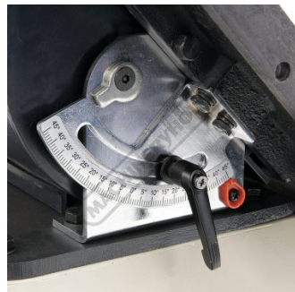
Table Tilt Lock Lever & Angle Degree Scale