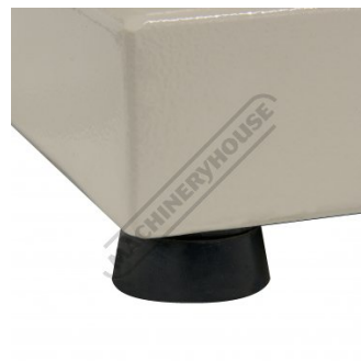
Anti Vibration Rubber Feet