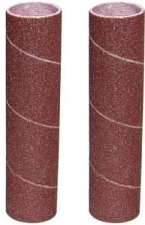
A8118 Bobbin Sanding Sleeves - Pack of 3