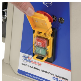
Safety Magnetic Start Stop Switch