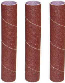
A8116 Bobbin Sanding Sleeves - Pack of 3