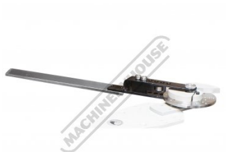
Shown On Optional Base