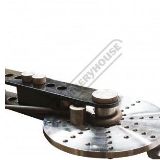
Shown Bending Eye In End Of Round Bar