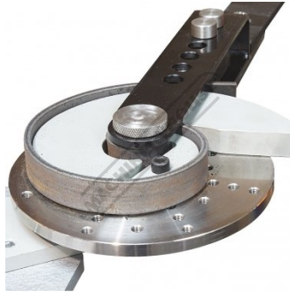
Shown Bending Flat Bar Scroll