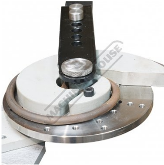
Shown Bending Round Bar Scroll