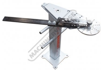
Shown On Optional Stand