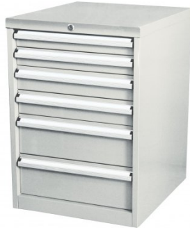
T764 Industrial Tooling Cabinet