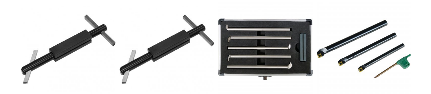
L430 Boring Bar Set - Carbide Insert