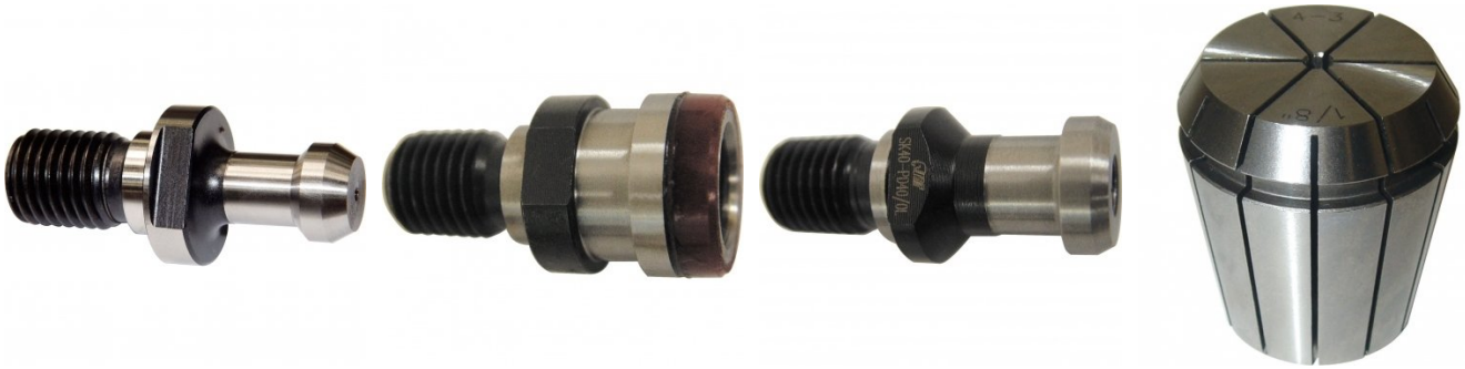
C934 ER40 Collet