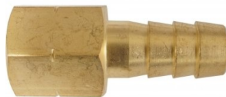
F811 Air Fittings