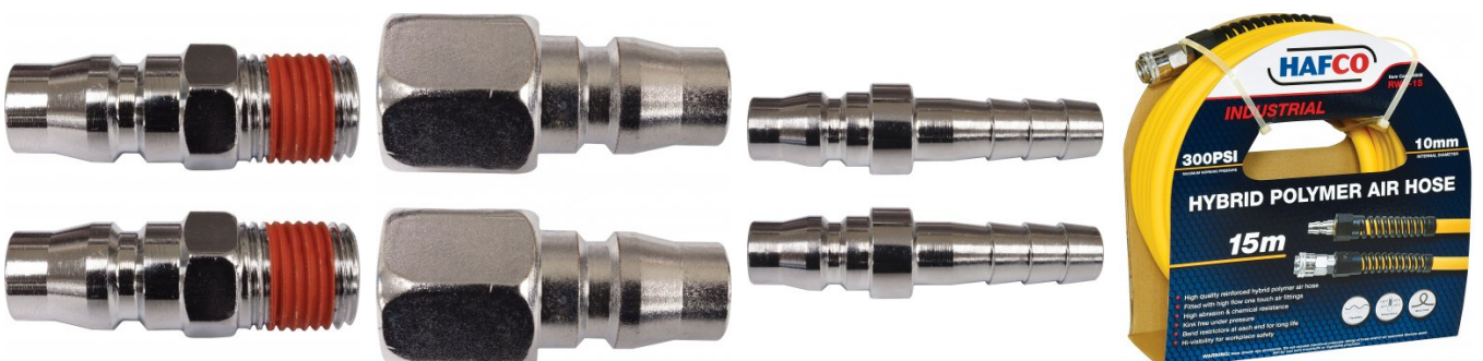
H008 Industrial Polymer Air Hose