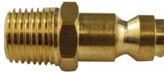
F902B Air Fittings