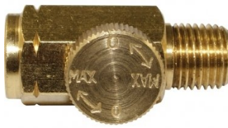
A219 Air Fittings