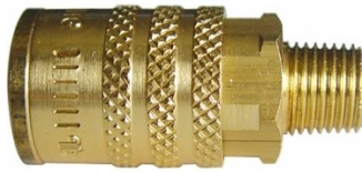
F901 Air Fittings