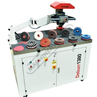
Full Range of Optional Accessories