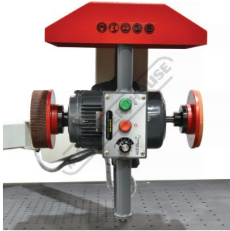
Deburring Head 90 Degree