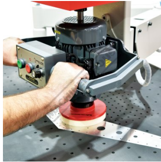
Wool Polishing Head